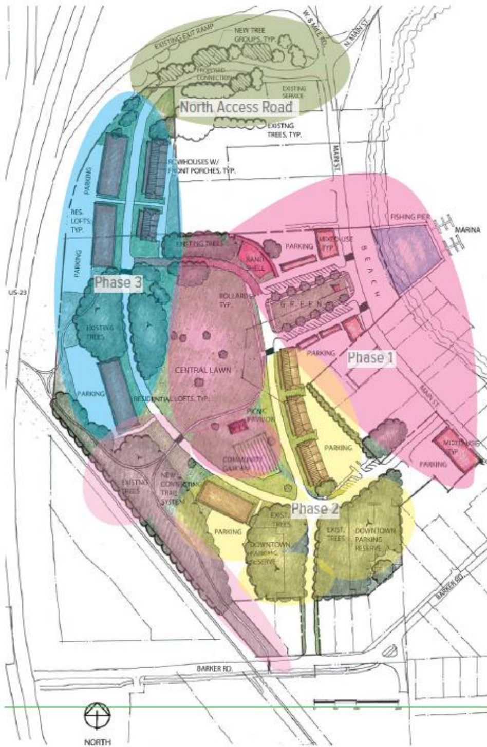
Figure 1: Phasing Plan: Park with Mixed Use – Moderate Development Intensity